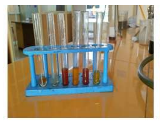
Fig: preliminary test (1)

Five ml of extract solution was mixed with 5 ml of Fehling's solution equal mixture of Fehling's solution A&B & boiled. Formation of