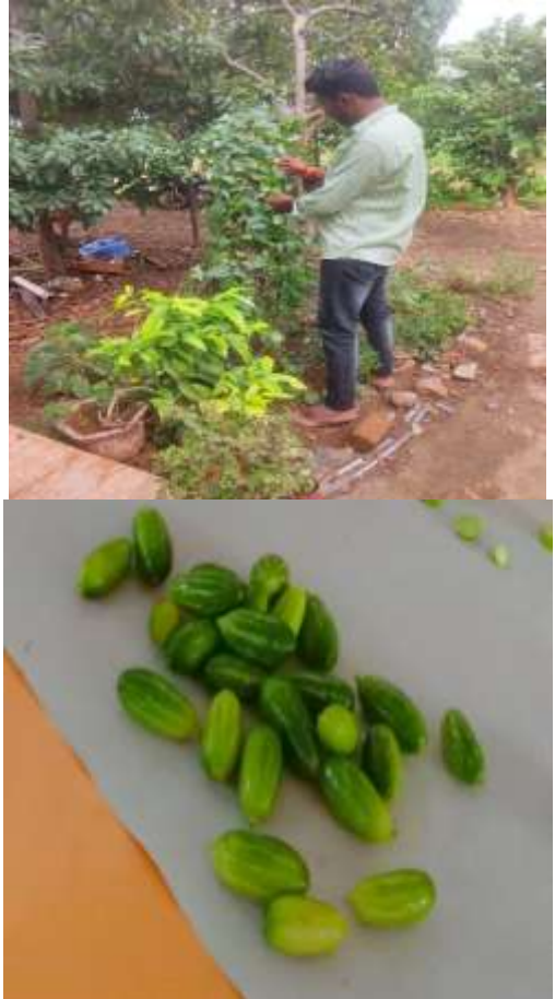
fig.2 Collection of fruitsfig.3 Fresh fruits

Fresh Fruits of Coccinia grandis linn were collected from the fields of LohegaonDist-Pune, Maharashtra India. cleaned and cut into small pieces of and dried at a room temperature. The dried fruits were coarsely powdered in grinder. Large difference in particle size of crude drug results in long extraction time as the coarse particles increases the extraction time and fine may form bed, so the powdered material was sieved through 60 to 120 mesh to remove fines and larger particles and the powder was subjected for further study.