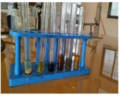
Fig: preliminary test (2)

Equal volumes of Benedict's reagent and extract in test tube boiled for min solution appeared green, yellow or red depending upon the amount of reducing sugar present