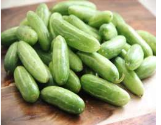
fig.1Coccinia grandis linn